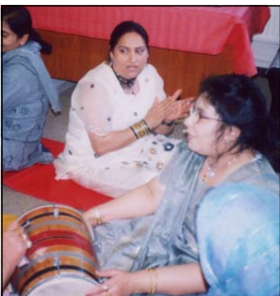
ZEMA celebrates Eid in 2003

ZEMA was launched in 2000 with an arts event in Illford where many artists performed in front of an audience which included Arts Council officials, the Mayoress and Asian television channels, who also covered the event. From then on, ZEMA further established itself. In addition to setting up a database of BME artists, it also promoted and organised three